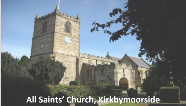
All Saints' Church, Kirkbymoorside

THE CHURCH MAGAZINE OF KIRKBYMOORSIDE – GILLAMOOR FADMOOR - FARNDALE - BRANSDALE - EDSTONE £1.00 PER COPY (£8:00 PER YEAR)