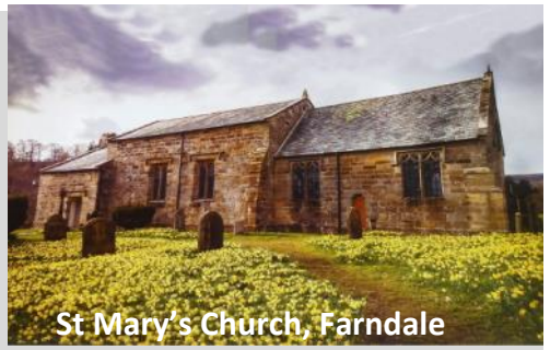
St Mary's Church, Farndale