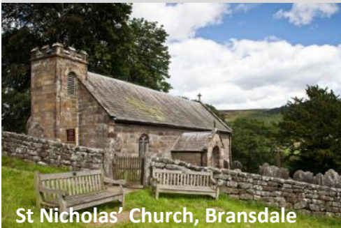
St Nicholas' Church, Bransdale

THE CHURCH MAGAZINE OF KIRKBYMOORSIDE – GILLAMOOR FADMOOR - FARNDALE - BRANSDALE - EDSTONE £1.00 PER COPY (£8:00 PER YEAR)