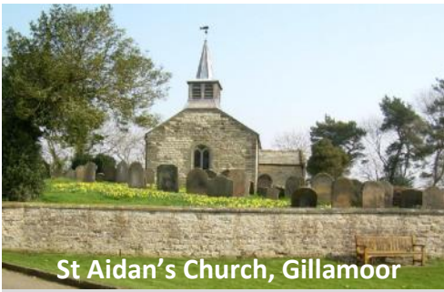
St Aidan's Church, Gillamoor