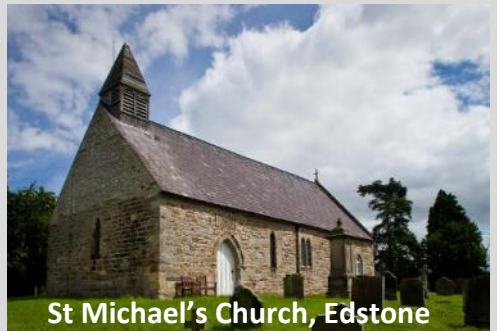
St Michael's Church, Edstone