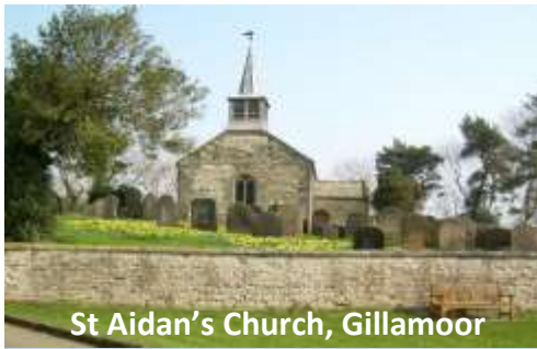
St Aidan's Church, Gillamoor