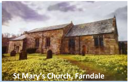
St Mary's Church, Farndale