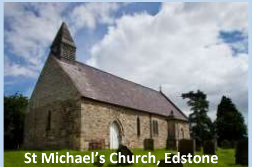
St Michael's Church, Edstone