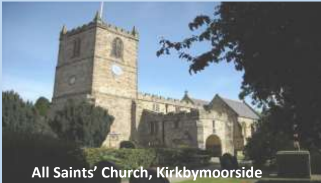
All Saints' Church, Kirkbymoorside

THE CHURCH MAGAZINE OF KIRKBYMOORSIDE – GILLAMOOR FADMOOR - FARNDALE - BRANSDALE - EDSTONE