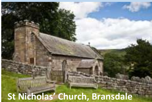
St Nicholas' Church, Bransdale

THE CHURCH MAGAZINE OF KIRKBYMOORSIDE – GILLAMOOR FADMOOR - FARNDALE - BRANSDALE - EDSTONE