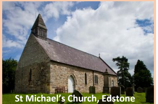
St Michael's Church, Edstone