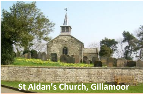
St Aidan's Church, Gillamoor