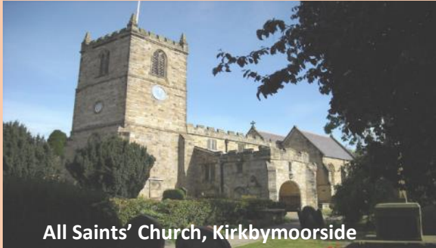
All Saints' Church, Kirkbymoorside

THE CHURCH MAGAZINE OF KIRKBYMOORSIDE – GILLAMOOR FADMOOR - FARNDALE - BRANSDALE - EDSTONE NO SUBSCRIPTION FOR 2021