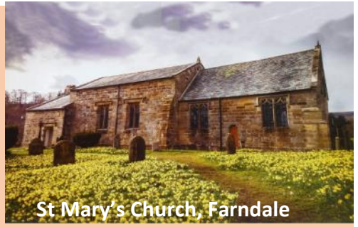
St Mary's Church, Farndale